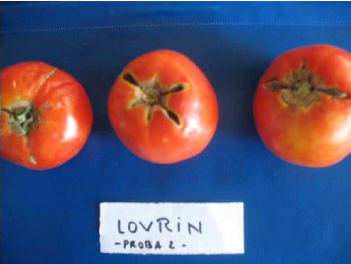
Visual aspect genotype Lovrin nr.1169 – pr.2 (fruit, time of harvest)