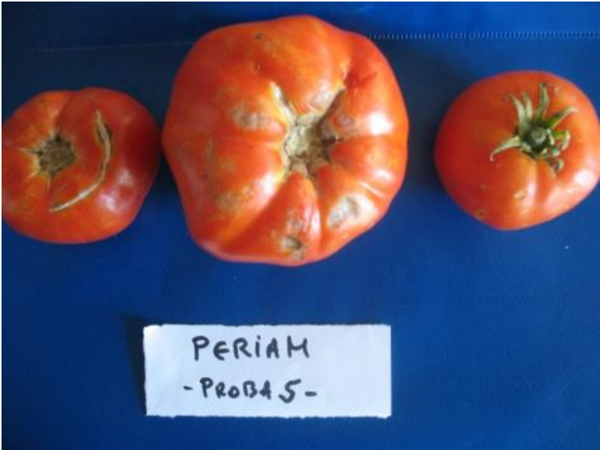
Visual aspect genotype Periam nr.48 – pr.5 (fruit, time of harvest)